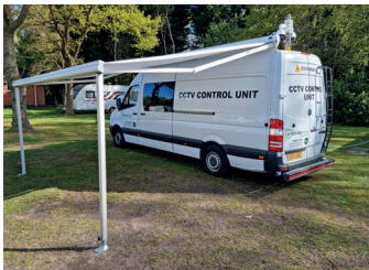
Windout Roof Only