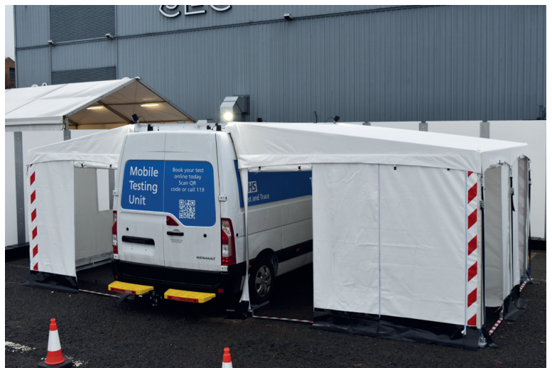
MTU by TGS

Do not make the mistake of purchasing Pop up tents that put your staff & public at high risk when the weather turns! Invest in a product made in Britain and built to last and have the full support of our team.