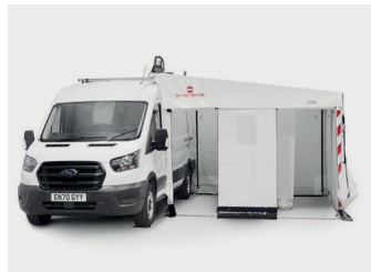
MPUT Plymouth Council by Butyl