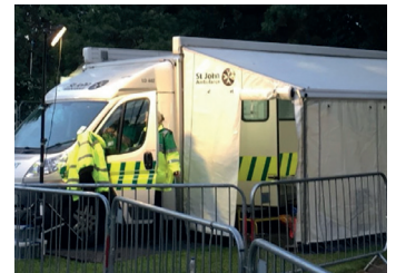
St John Ambulance