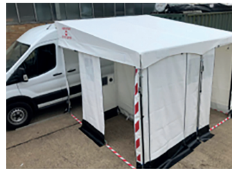
MPU by Vantage