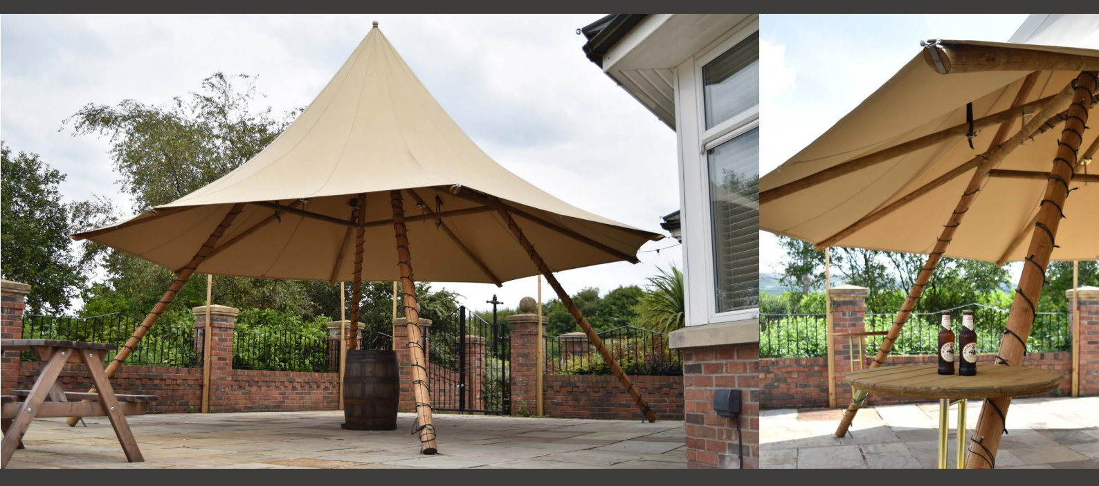
Additional option to be finished in our traditional tipi canvas